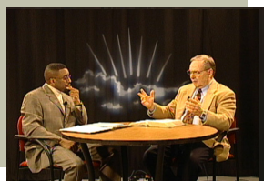
Dr. Norman Geisler

Giving An Answer ministers to the needs of the community through both television and radio. The radio show currently airs on 1240 AM in the Charlotte/Mecklenburg county area and 1150 AM in the Fort Mill and Rock Hill, South Carolina areas. It reaches a potential audience of over 1,000,000. The TV show airs on local cable access in Mecklenburg county NC and reaches a potential audience of 350,000 people. In addition to radio and TV, this ministry goes directly to the people through speaking opportunities.